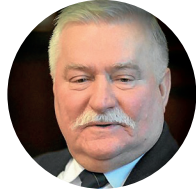
Lech Wałęsa President of Poland 1990-1995