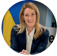
Roberta Metsola President of European Parliament since 2022