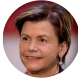
Baiba Braže Minister of Foreign Affairs - Latvia