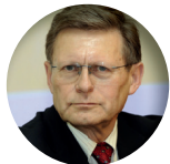
prof. Leszek Balcerowicz Father of economical reforms in Poland after 1989