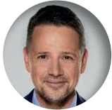
Rafał Trzaskowski President of Warsaw