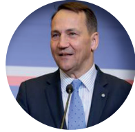
Radosław Sikorski Minister of Foreign Affairs Poland