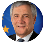
Antonio Tajani Chairman of European Parliament 2017-2019