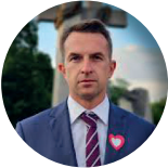
Adam Szapka Minister for EU affairs in Poland