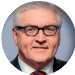
Frank-Walter Steinmeier President of Germany since 2017